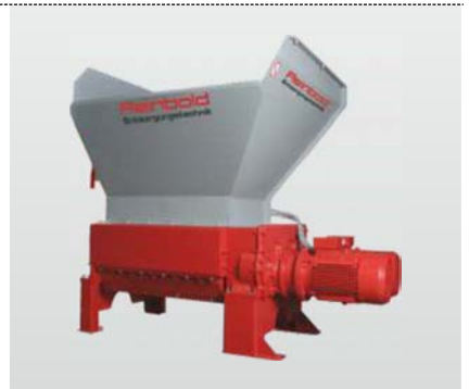
Series RMZ 500 - RMZ 1000 S: The four-shaft shredder that is ideal for shredding long stock

Drawing on its many years of experience, Reinbold, with its broad range of machines, is able to offer ideal solutions for different applications in material shredding and briquetting. Our testing facility is available to perform tests on your material.