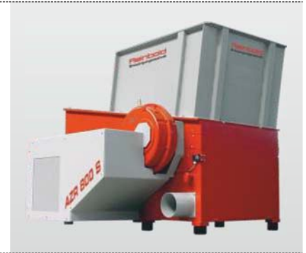
Series AZR 800 - AZR 2000 S Gigant: the single shaft shredder for profes- sional compaction of recyclables