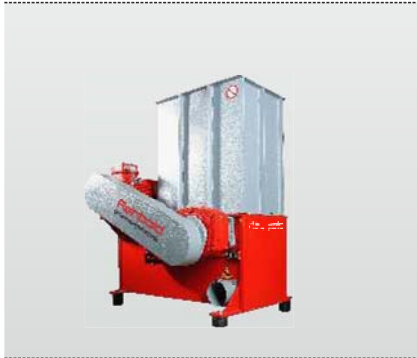
Series AZR 50 Primus: the starter model of the single-shaft shredders with drawer feed