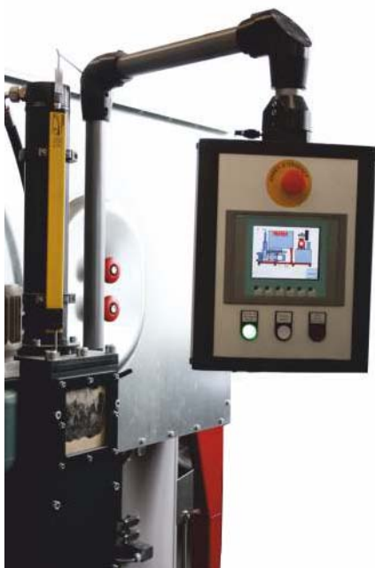
Control panel for control and programming of the briquetting press with touch screen