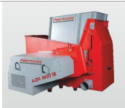
Series AZR 600 K - 2000 S K Gigant: the single shaft shredder for effective plastics shredding