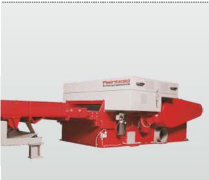
Series RLZ 400 - RHZ 1300 S: the horizontal shredder with horizontal mate- rial feed