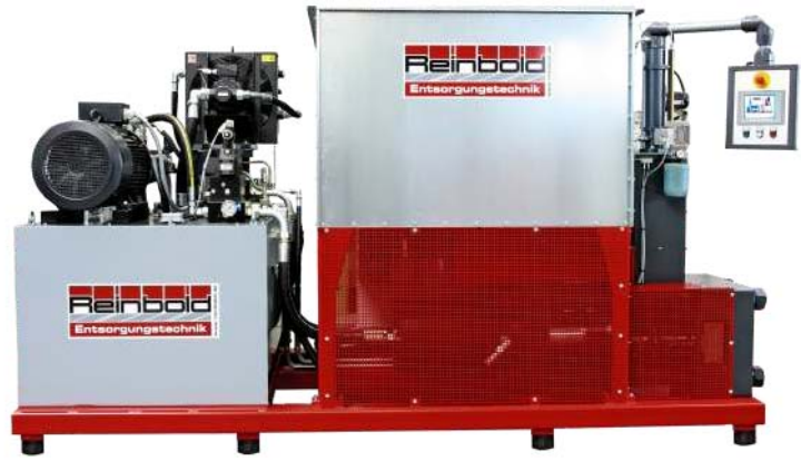
Option: stable base frame and hopper