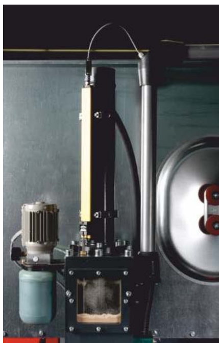
Position sensor for controlling the operations of the cylinder and the form. In addition, the central lubrication system