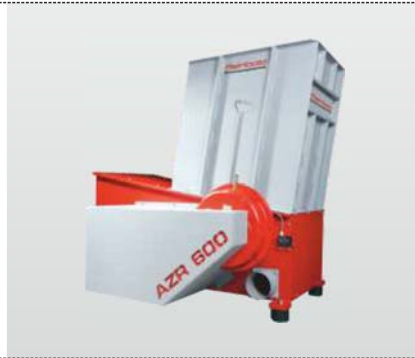
Series AZR 600 - AZR 800 S: the universal single shaft shredder for woodworking shops