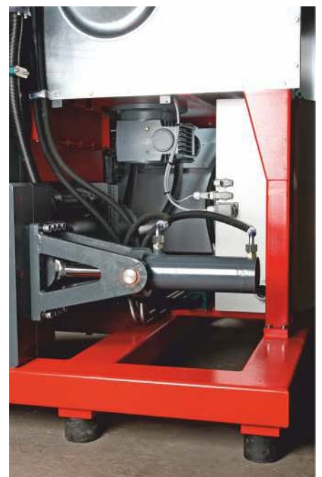
Powerful hydraulic cylinders, gear motors for the agitator and screw conveyor